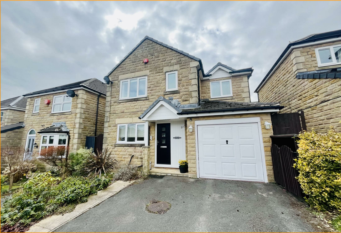
7 Helston Grove Honley, Holmfirth, HD9 6GL

54 JOHN WILLIAM STREET HUDDERSFIELD HD1 1ER 01484 515029